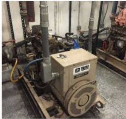
Old Tier 0 Diesel Generator