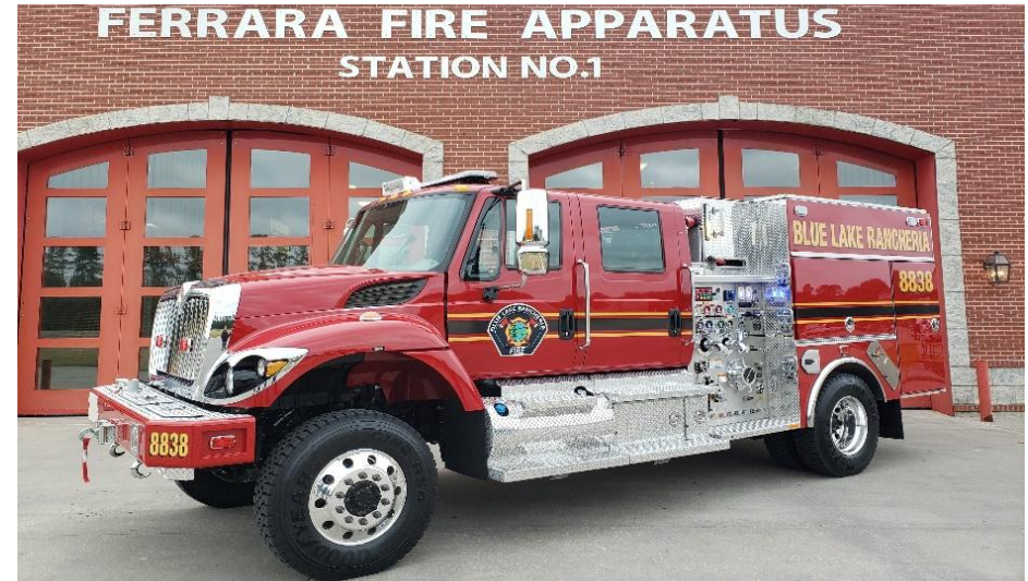
Old Fire Emergency Vehicle