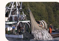
Tribal and Territory Grants